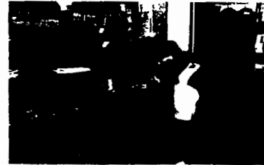
A race team mechanic makes repairs with a Lincoln Square Wave TIG 350.

The race itself was the usual mixture of crushing disappointment and high triumph. A close loss has to be just as tough as falling out early. Unfortunately, there can be only one winner. But any of the cars that survive the lengthy, high-speed grind are triumphs of men and technology. All should take pride in their achievements.