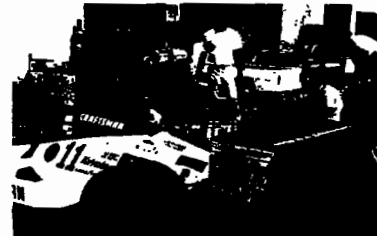
Crews of mechanics continuously fine tune their Indy cars